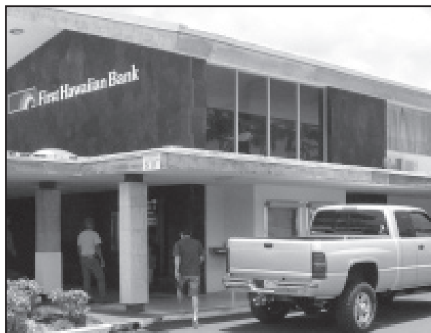
First Hawaiian Bank recently opened its new Drive Thru ATM, conveniently located in the heart of Hilo. IEG FCU members can withdraw a maximum of $500 cash with no fees.