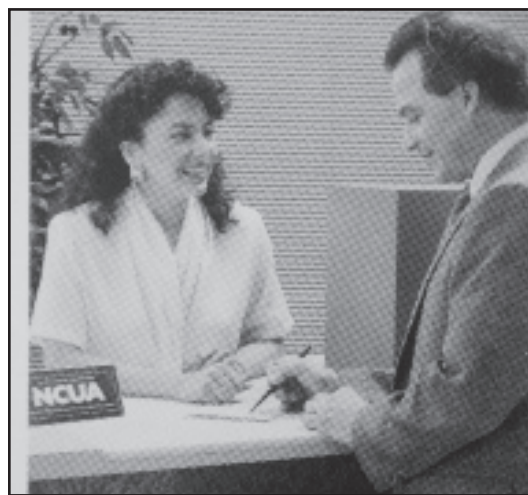
Members can withdraw cash or make deposits at 9 other credit union branch offices throughout the state.

Members can also make loan payments, receive approved loan proceeds and get travelers checks and money orders. With corresponding credit unions on every island, IEG members don't have to worry about doing their banking while on neighbor island vacations or business trips. For more information, call your credit union at (808) 961-6691 or Toll-Free 800-762-3958.